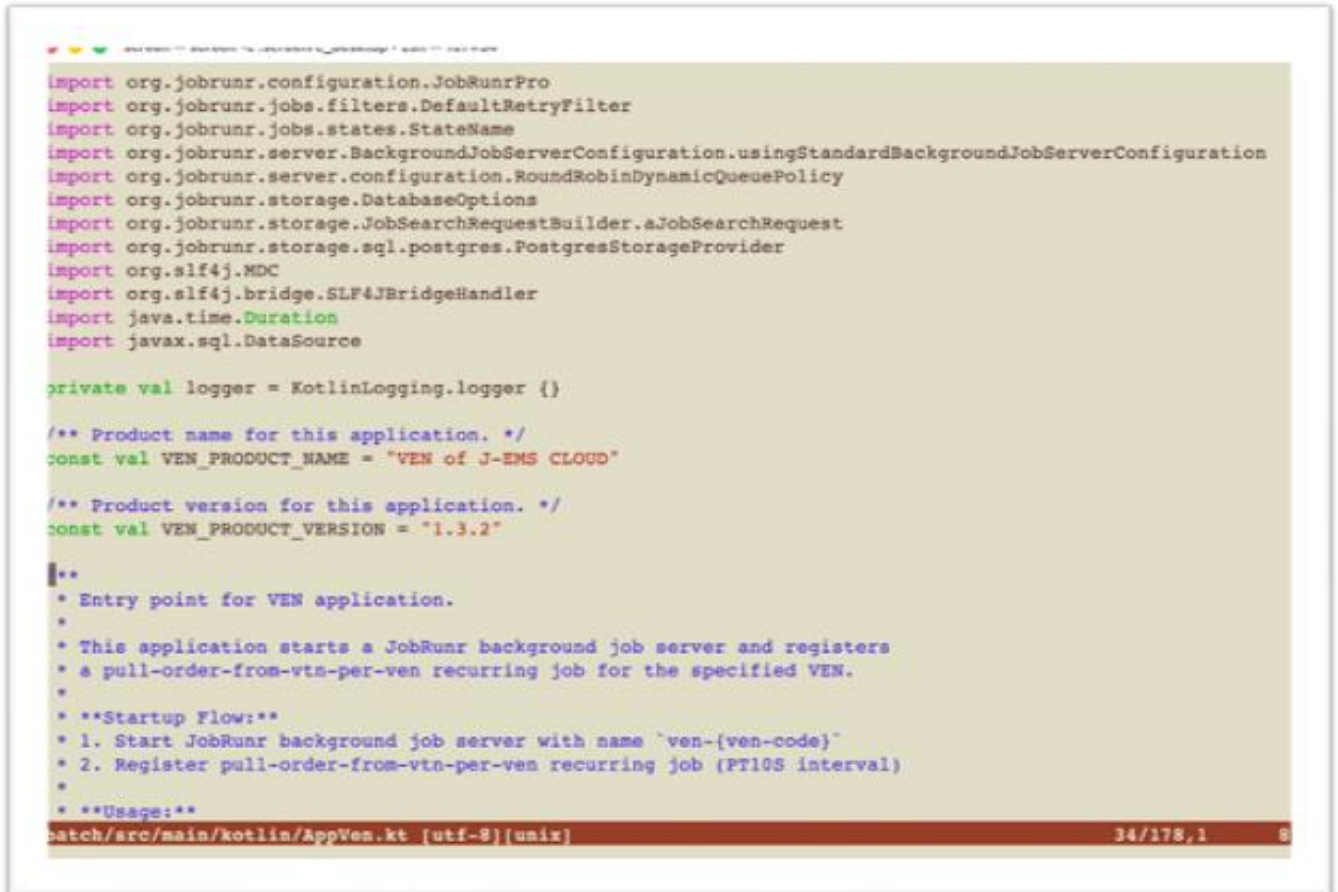
Photo 1: System screen capture (Software Information, Company Information)